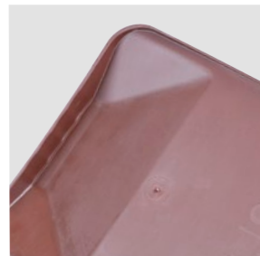
Recessed hand grip on the base