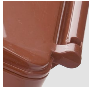
Sturdy hinges and clip-on lid

Urba 20, 23 and 25 containers ergonomically designed with tapered shaped body and square base with minimal footprint. They can be used in all types of properties, either inside or outside the home or office.