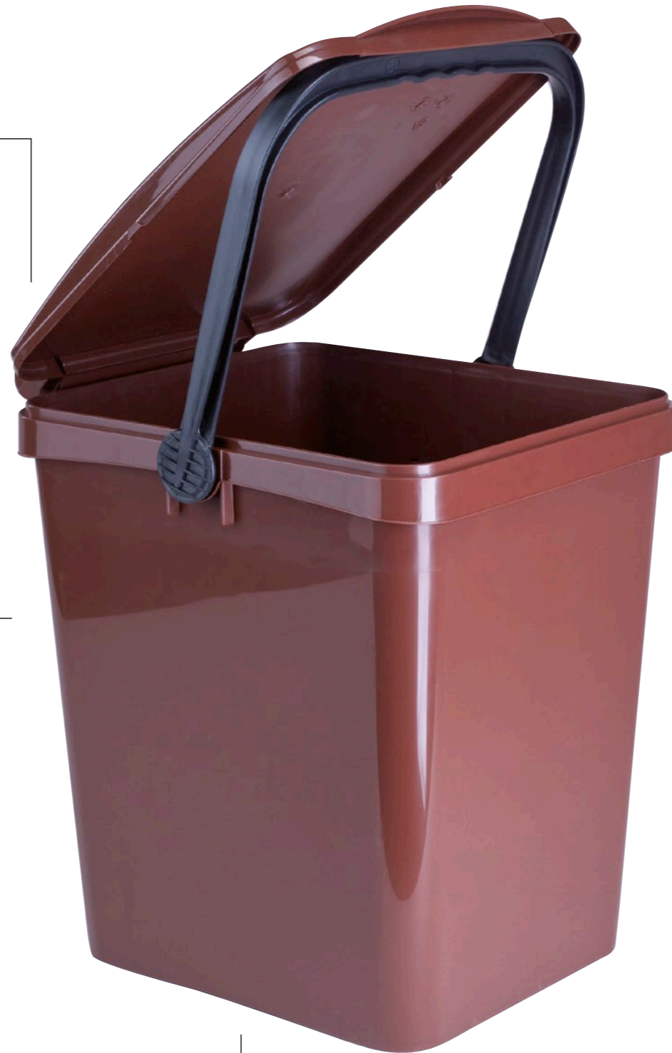
Lid or body with IML printing option